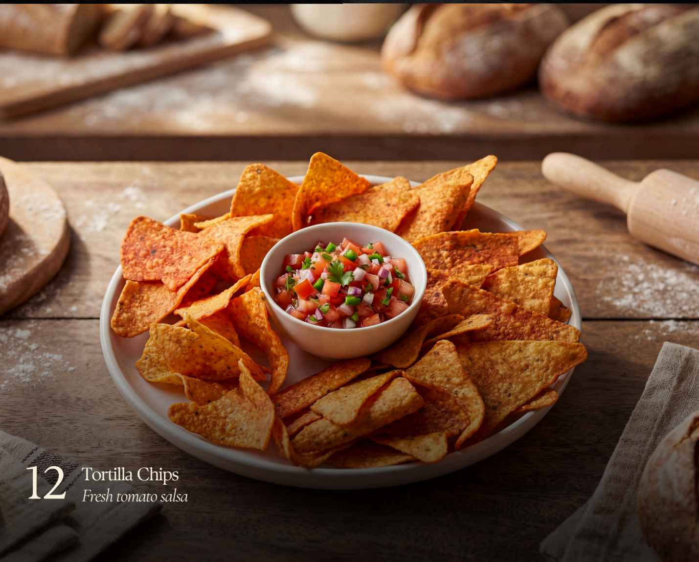
12 Tortilla Chips Fresh tomato salsa