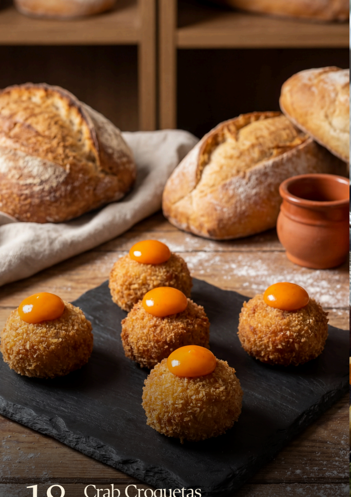
18 Crab Croquetas Chipotle mayo