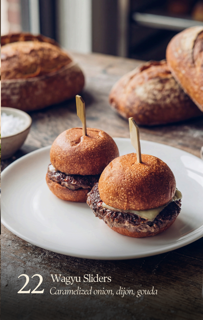
22 Wagyu Sliders Caramelized onion, dijon, gouda