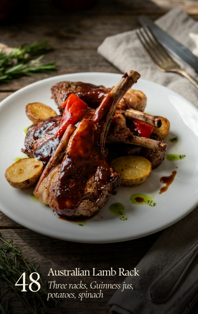
48 Australian Lamb Rack Three racks, Guinness jus, potatoes, spinach