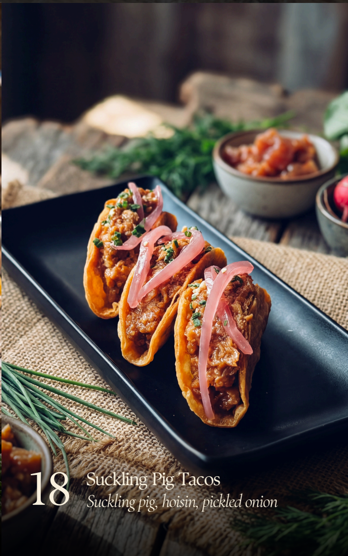
18 Suckling Pig Tacos Suckling pig, hoisin, pickled onion