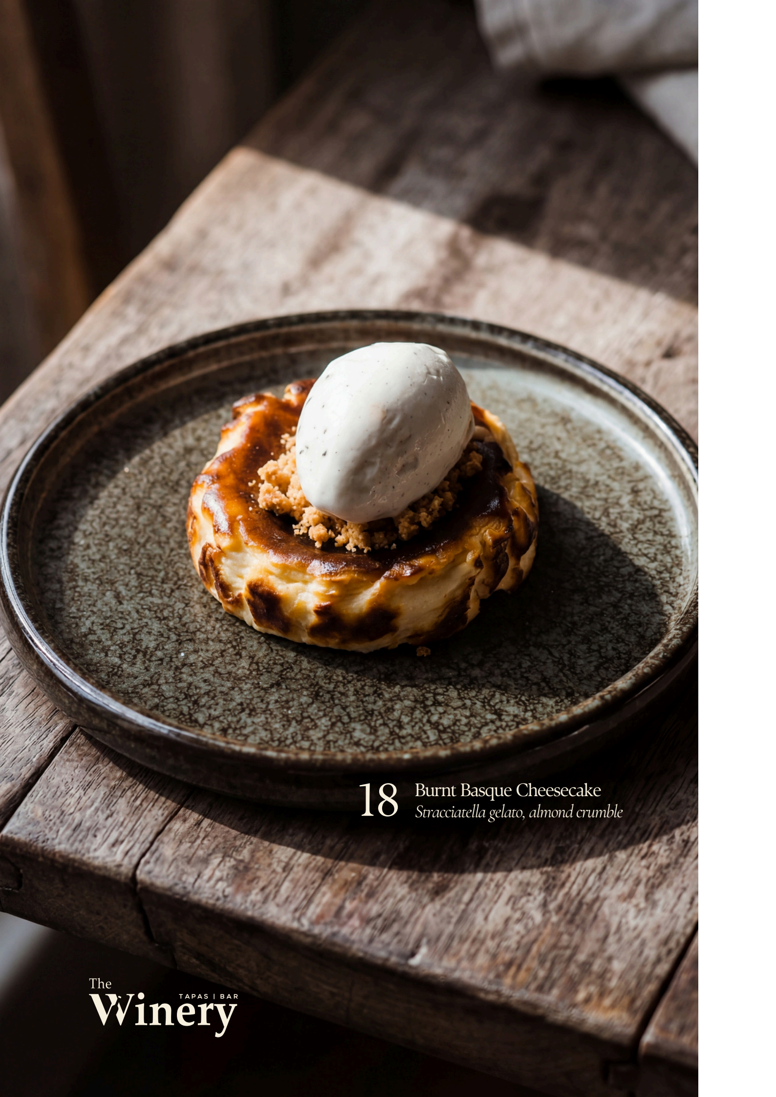
18 Burnt Basque Cheesecake Stracciatella gelato, almond crumble