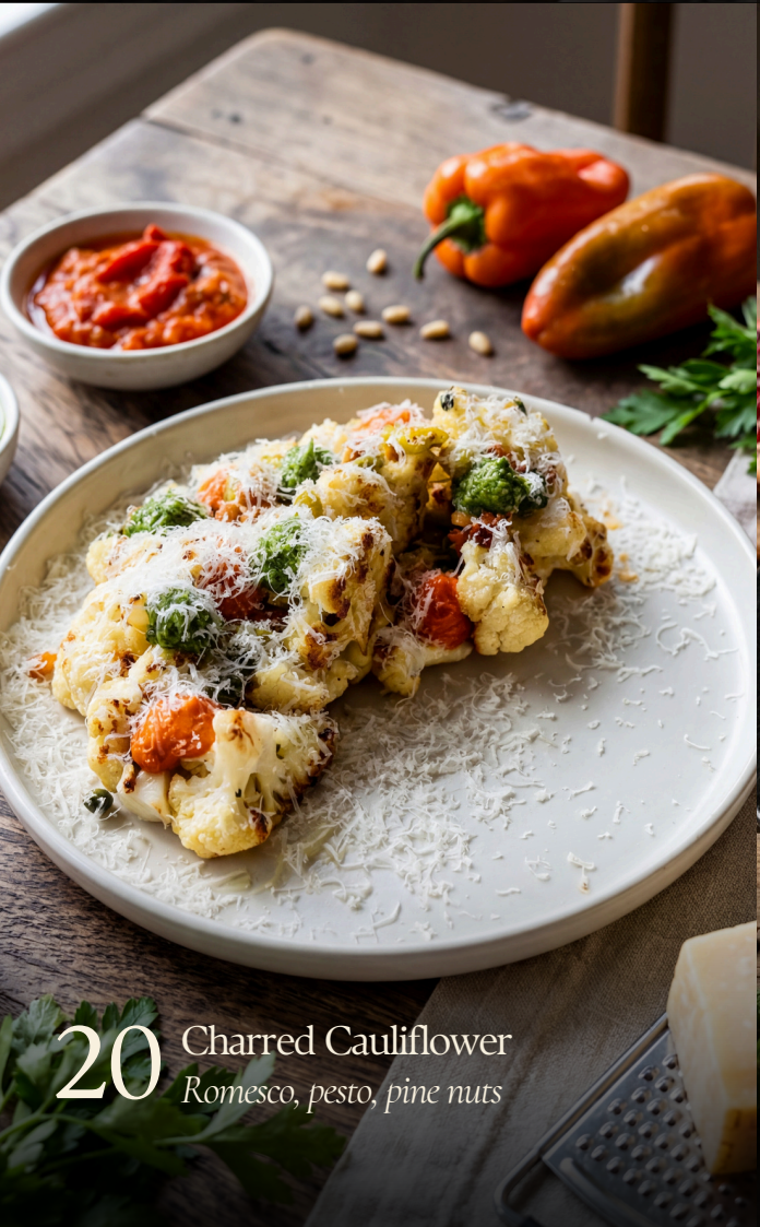
20 Charred Cauliflower Romesco, pesto, pine nuts