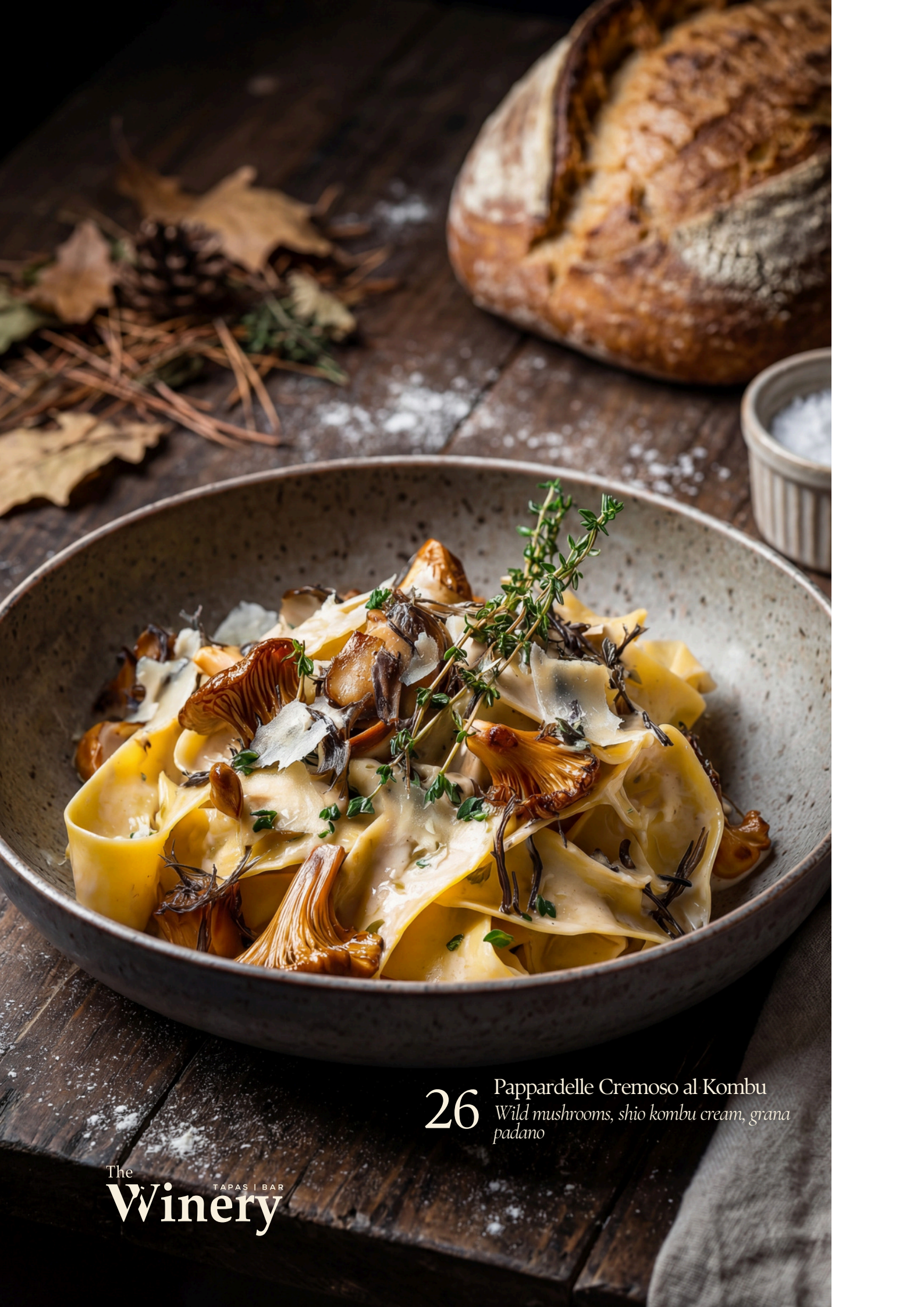
26 Pappardelle Cremoso al Kombu Wild mushrooms, shio kombu cream, grana padano