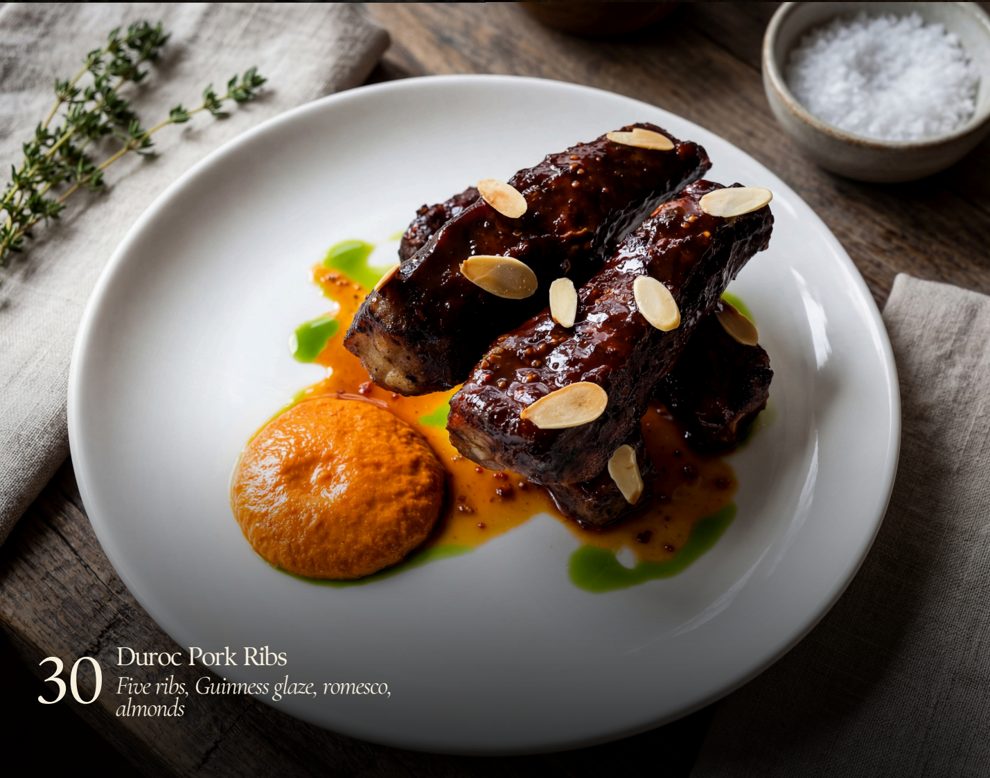
30 Duroc Pork Ribs Five ribs, Guinness glaze, romesco, almonds