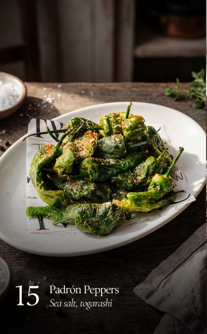
15 Padrón Peppers Sea salt, togarashi