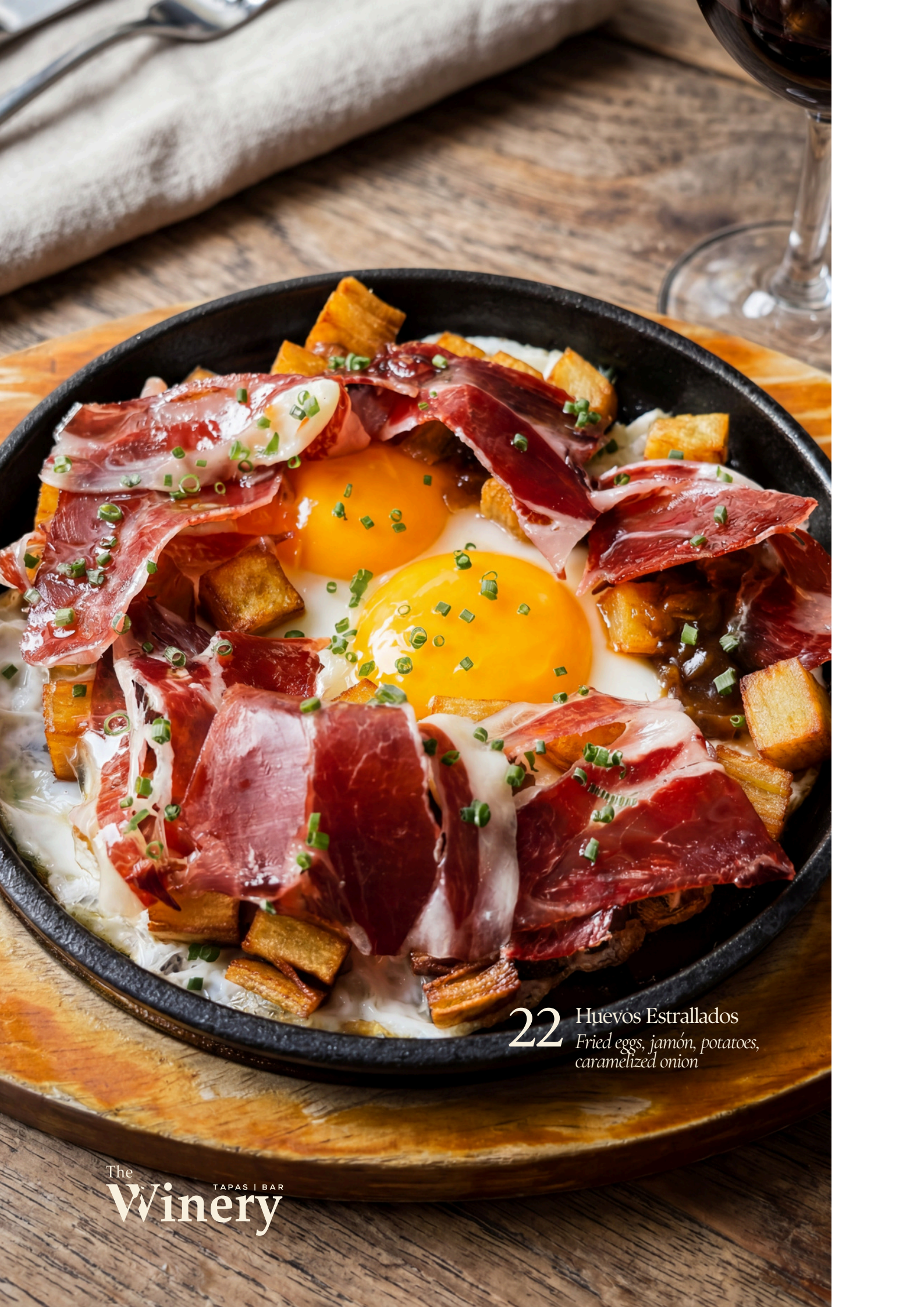
22 Huevos Estrallados Fried eggs, jamón, potatoes, caramelized onion