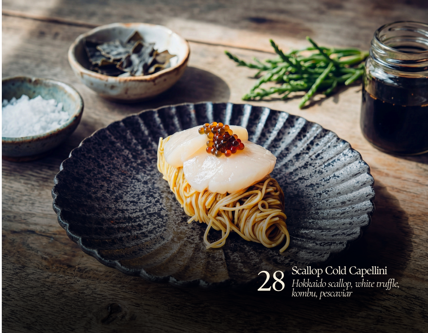
28 Scallop Cold Capellini Hokkaido scallop, white truffle, kombu, pescaviar