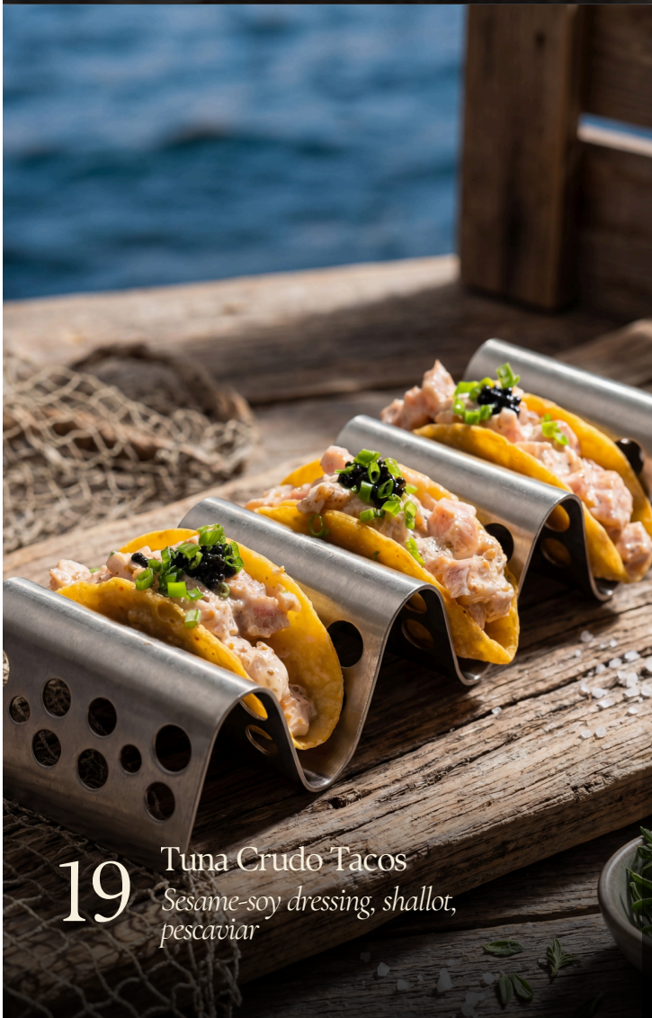
19 Tuna Crudo Tacos Sesame-soy dressing, shallot, pescaviar