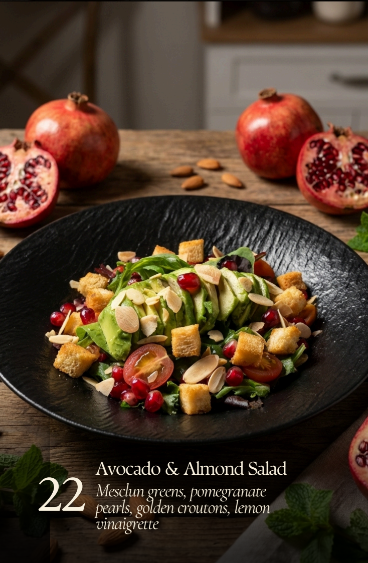
22 Avocado & Almond Salad Mesclun greens, pomegranate pearls, golden croutons, lemon vinaigrette