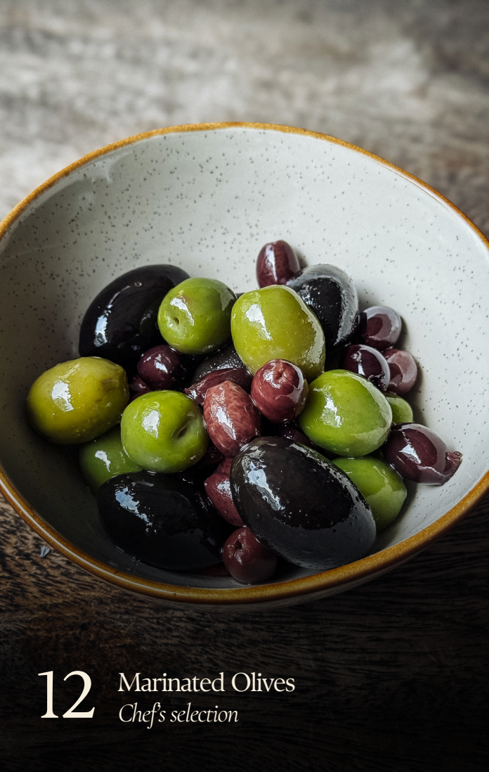
12 Marinated Olives Chef's selection