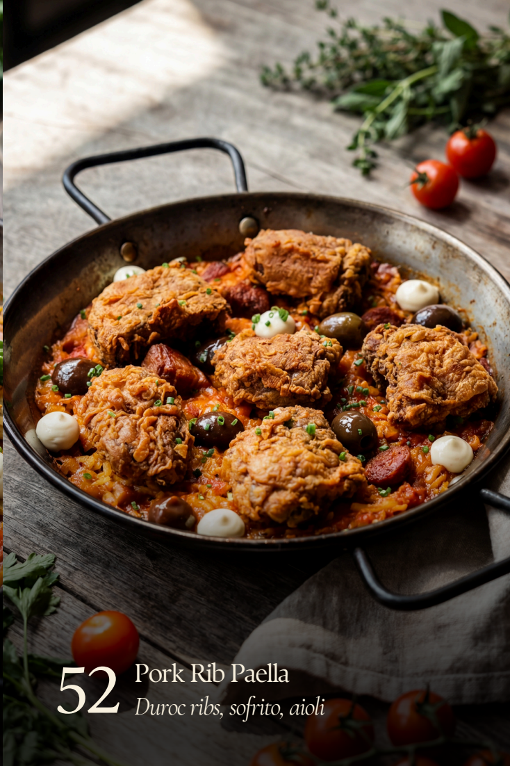
52 Pork Rib Paella Duroc ribs, sofrito, aioli