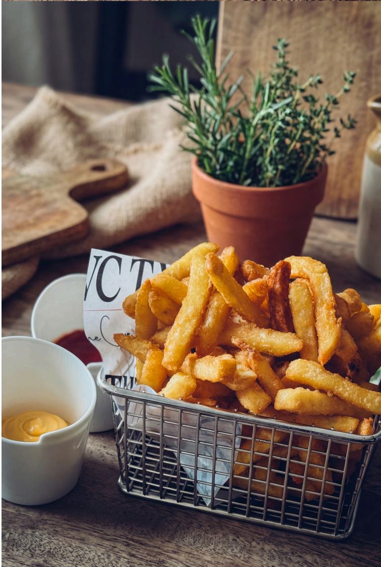
14 Triple-fried Fries Truffle mayo