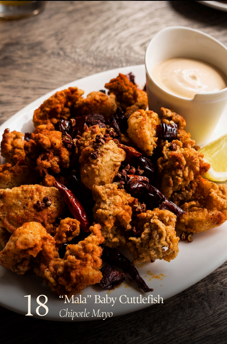
18 "Mala" Baby Cuttlefish Chipotle Mayo