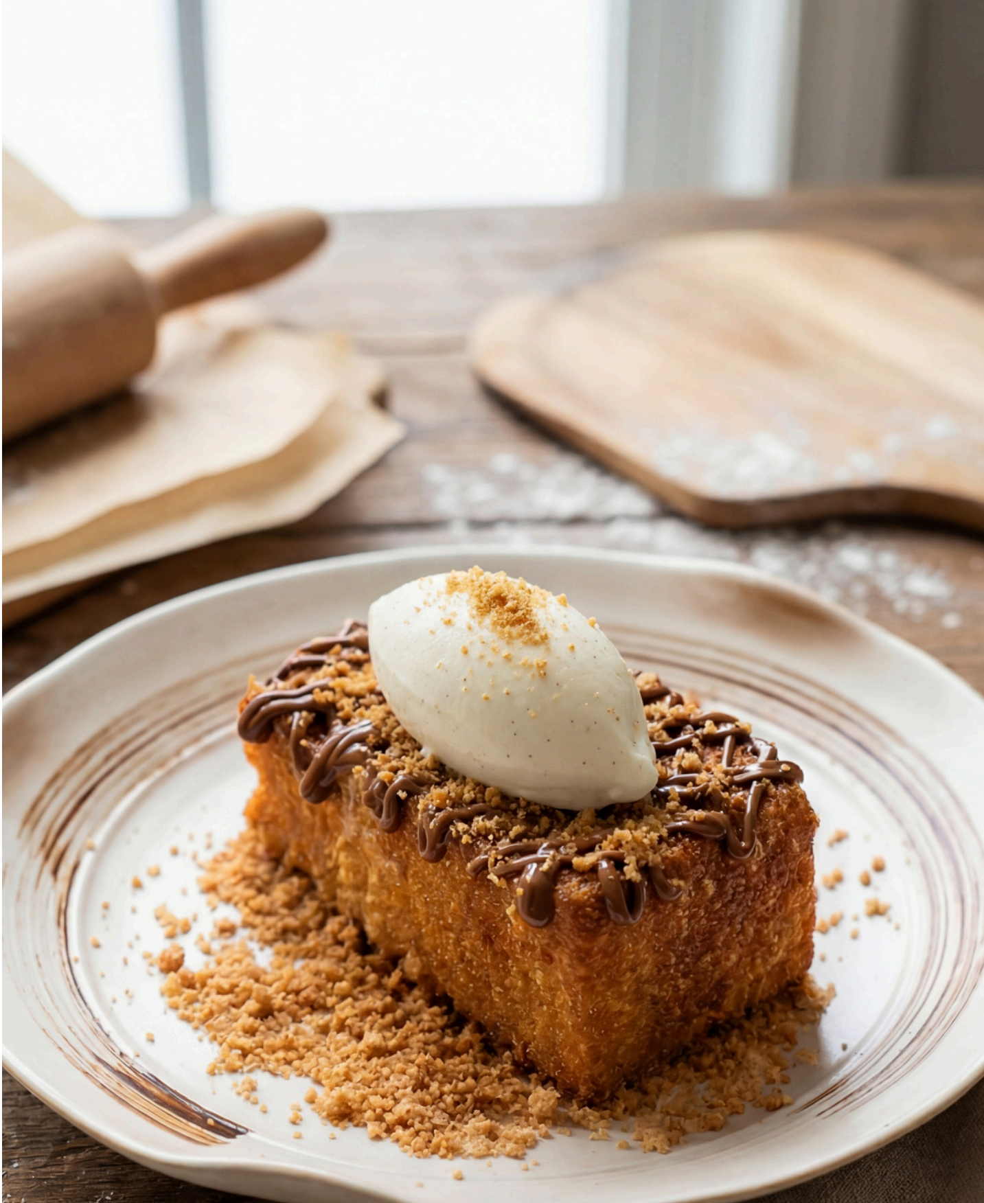
16 Torrijas Brioche, chocolate praline, almond crumble, stracciatella