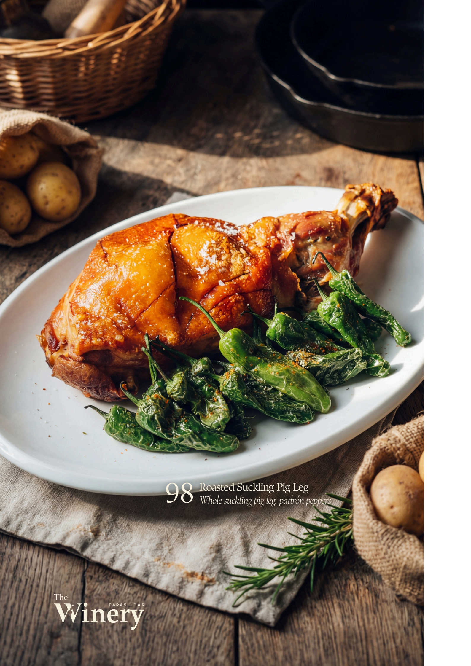
98 Roasted Suckling Pig Leg Whole suckling pig leg, padrón peppers