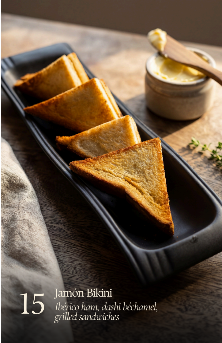
15 Jamón Bikini Ibérico ham, dashi béchamel, grilled sandwiches