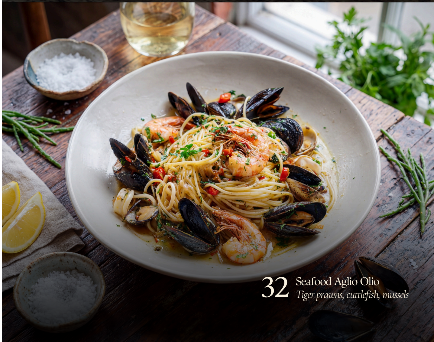
32 Seafood Aglio Olio Tiger prawns, cuttlefish, mussels