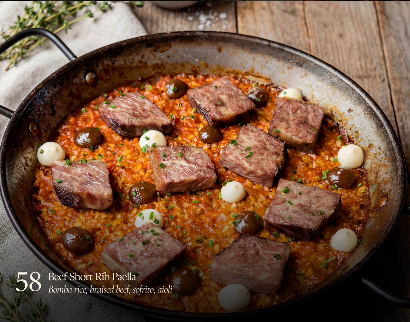
58 Beef Short Rib Paella Bomba rice, braised beef, sofrito, aioli