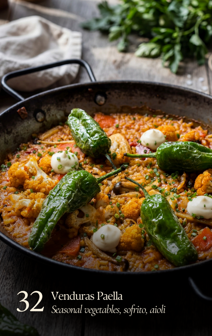
32 Venduras Paella Seasonal vegetables, sofrito, aioli