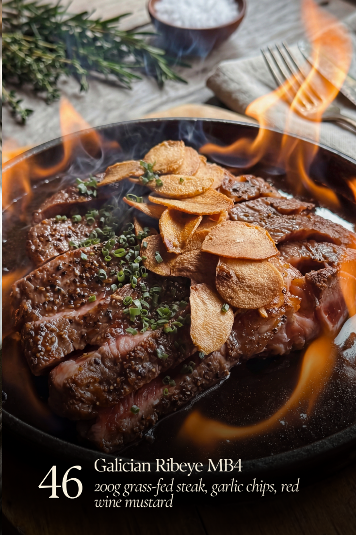
46 Galician Ribeye MB4 200g grass-fed steak, garlic chips, red wine mustard