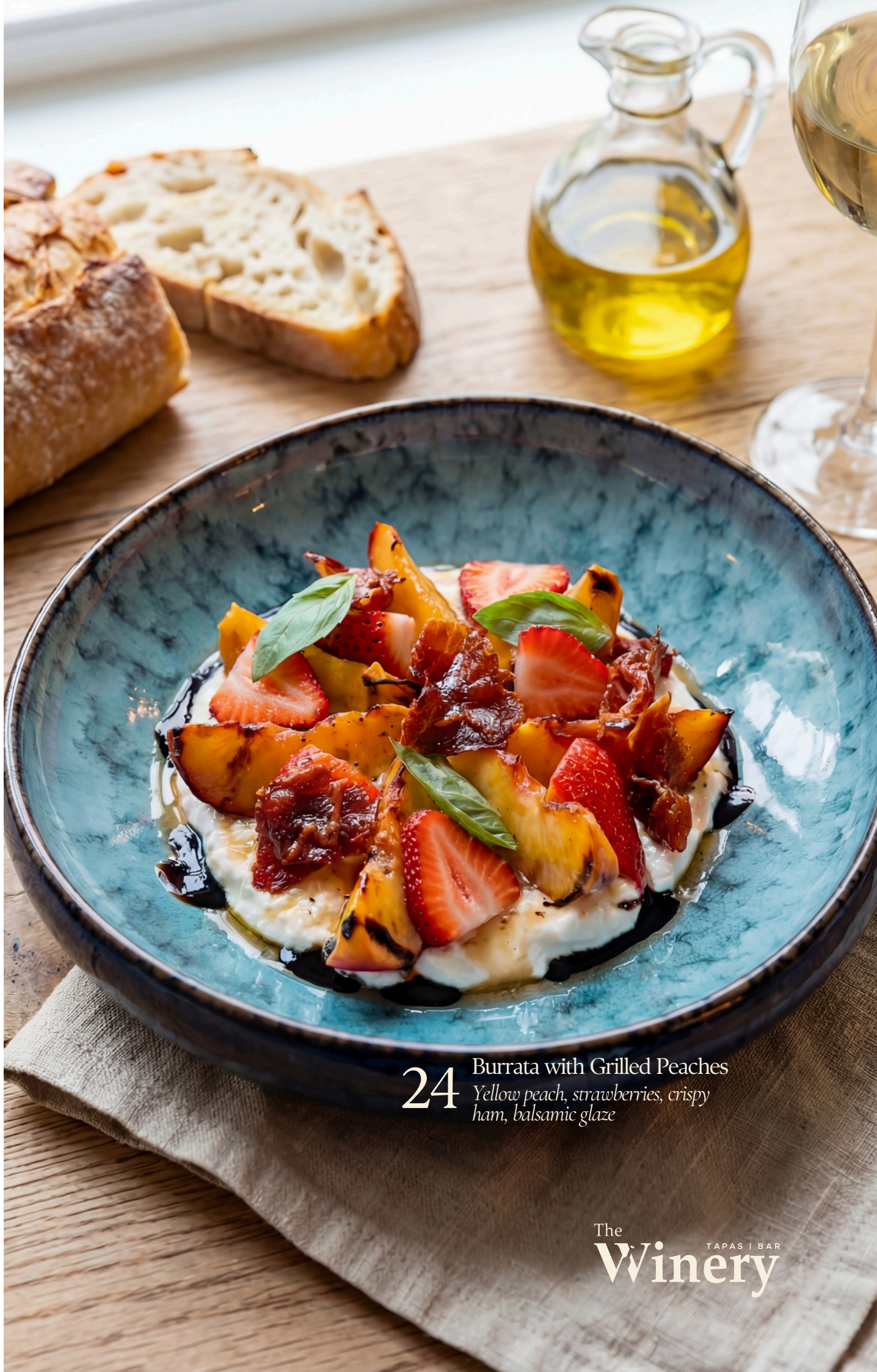
24 Burrata with Grilled Peaches Yellow peach, strawberries, crispy ham, balsamic glaze