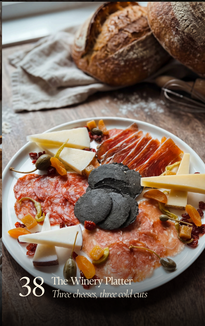
38 The Winery Platter Three cheeses, three cold cuts