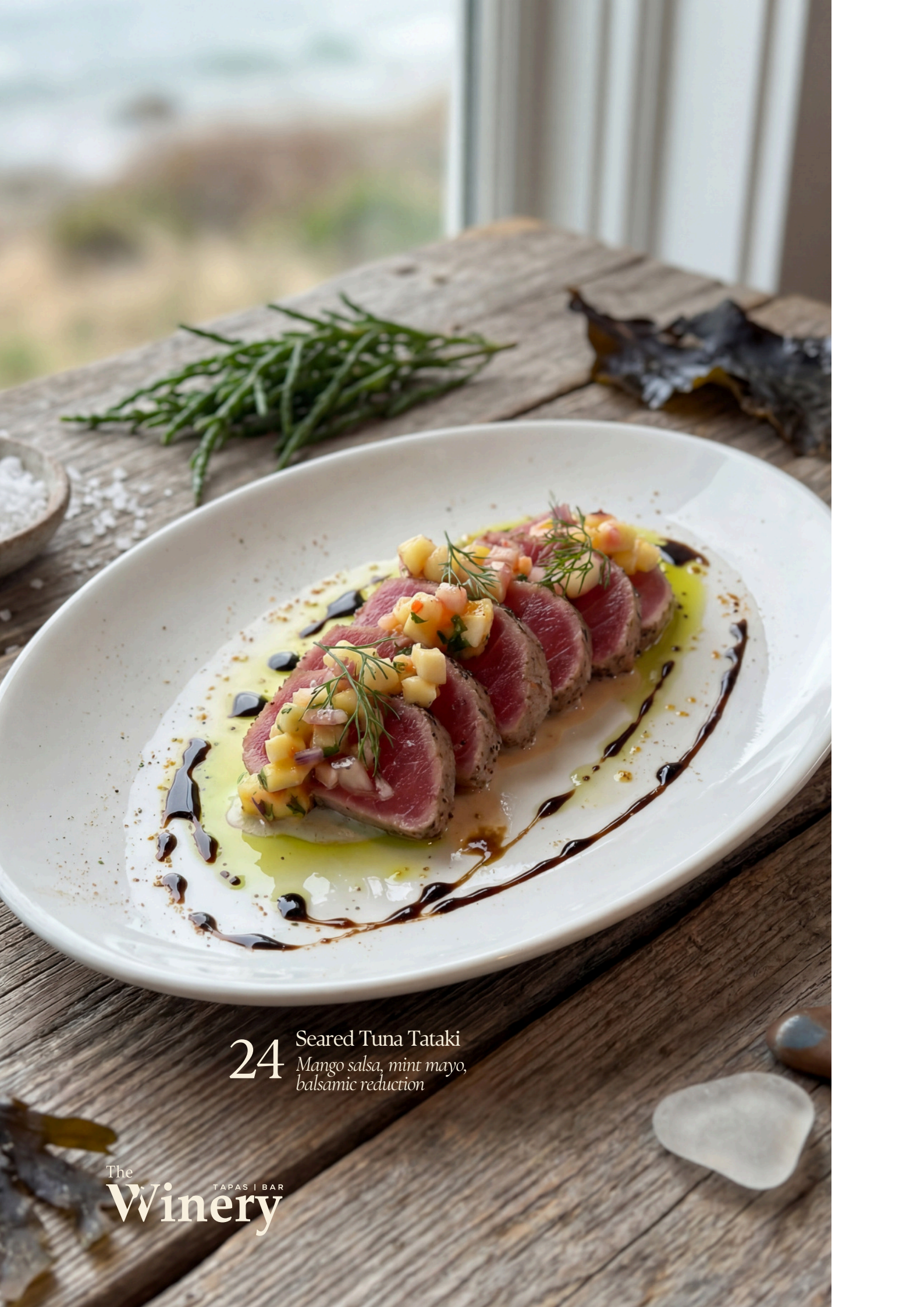
24 Seared Tuna Tataki Mango salsa, mint mayo, balsamic reduction