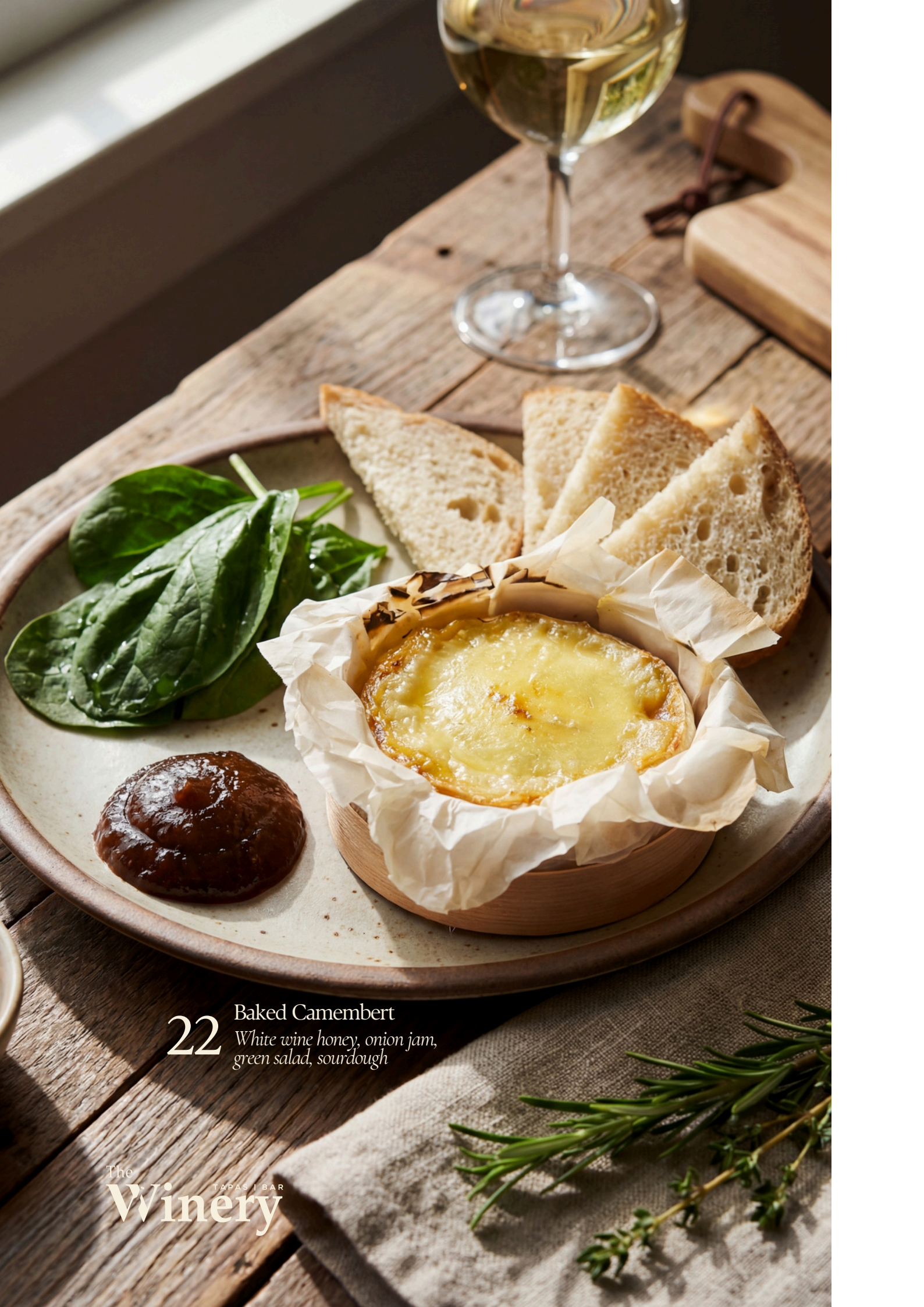
22 Baked Camembert White wine honey, onion jam, green salad, sourdough