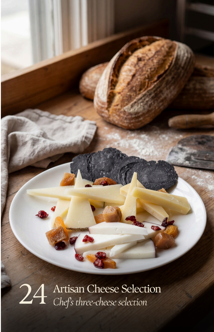
24 Artisan Cheese Selection Chef's three-cheese selection