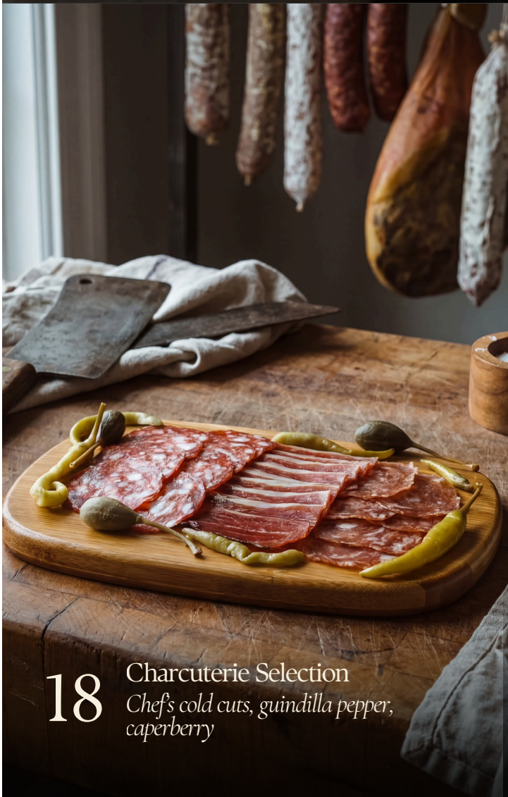
18 Charcuterie Selection Chef's cold cuts, guindilla pepper, caperberry