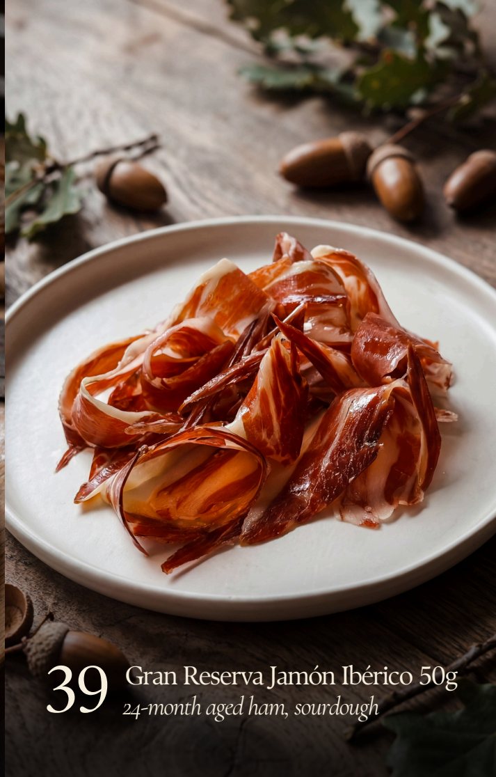
39 Gran Reserva Jamón Ibérico 50g 24-month aged ham, sourdough