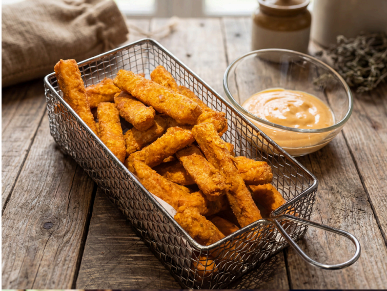
22 Winery Spam Fries Chipotle mayo