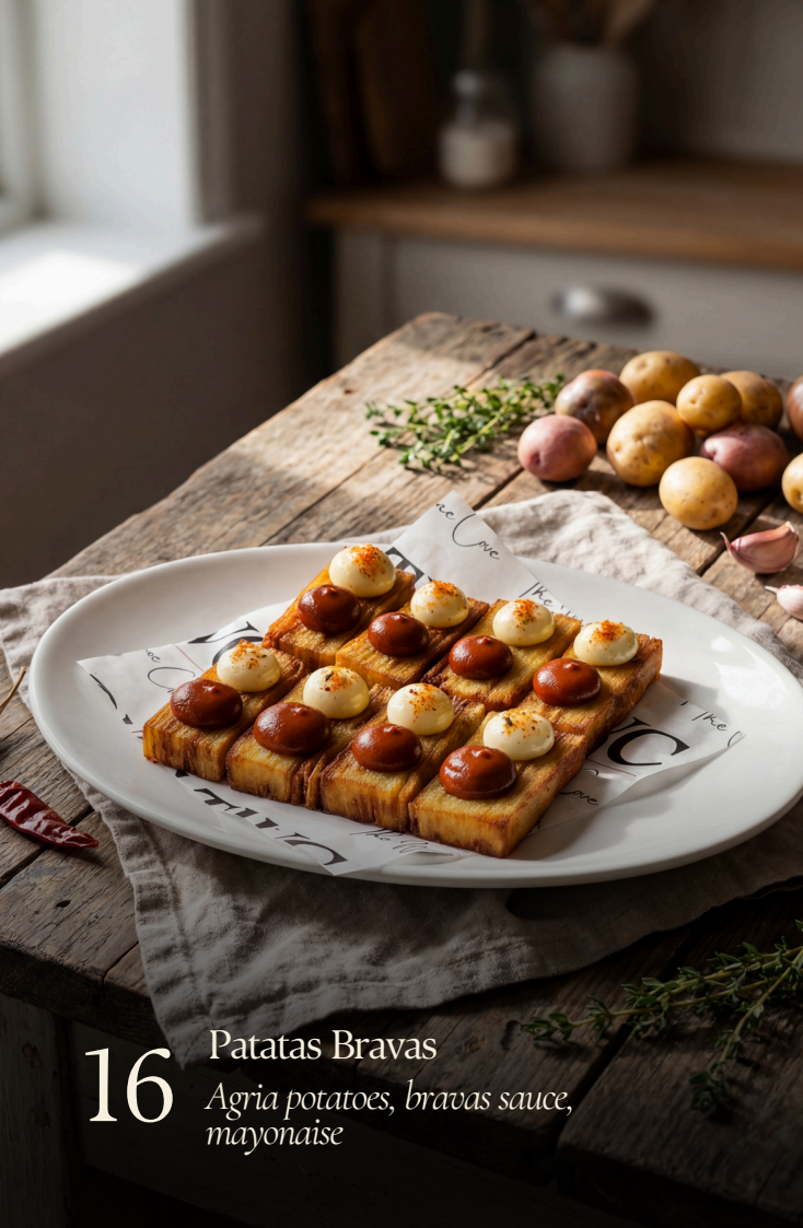
16 Patatas Bravas Agria potatoes, bravas sauce, mayonaise