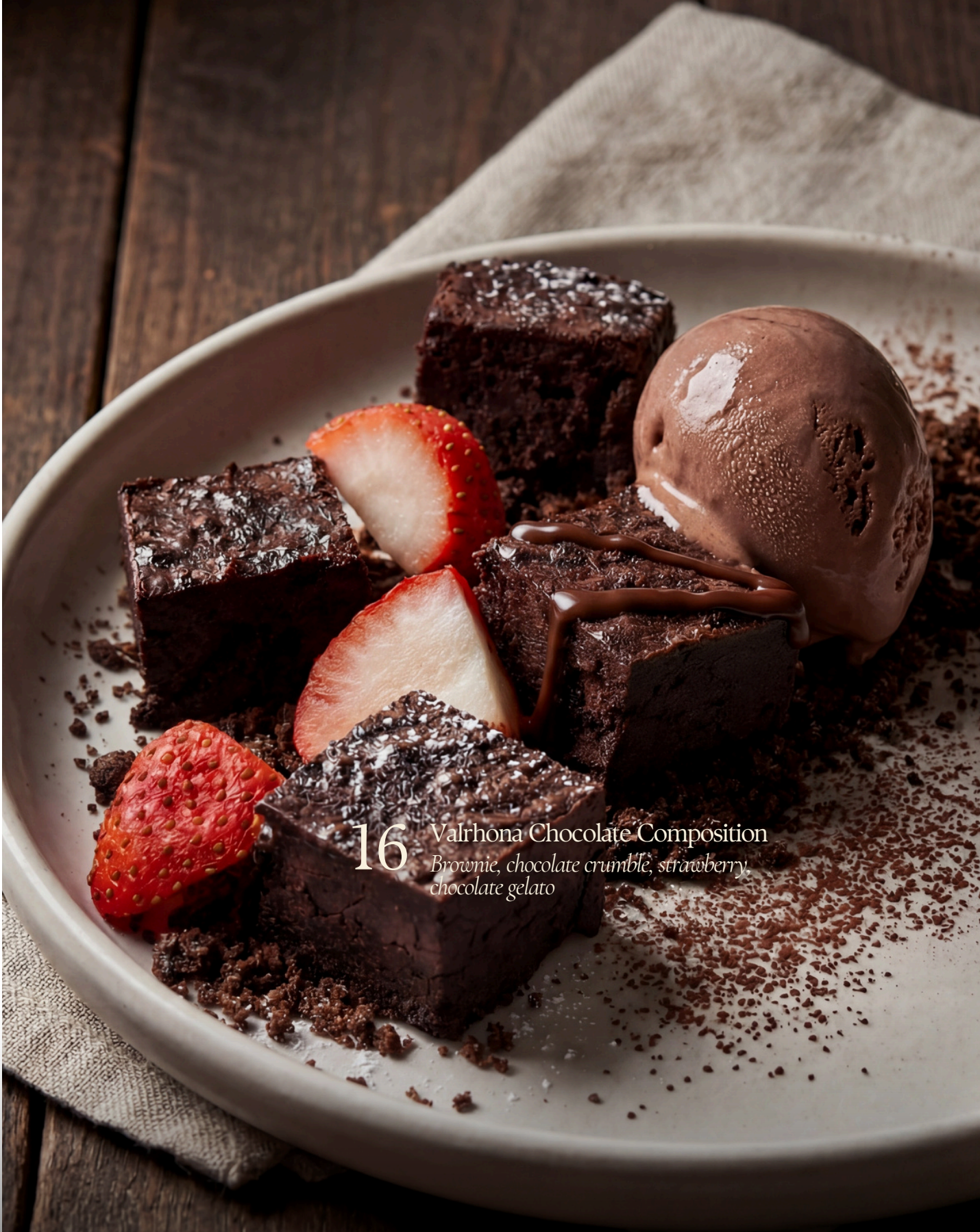
16 Valrhona Chocolate Composition Brownie, chocolate crumble, strawberry, chocolate gelato