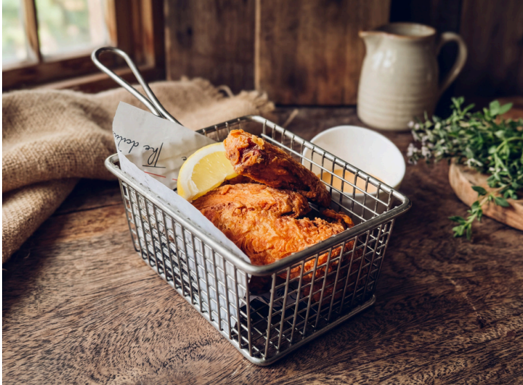
18 Chicken Wings Free-range wings, house sambal