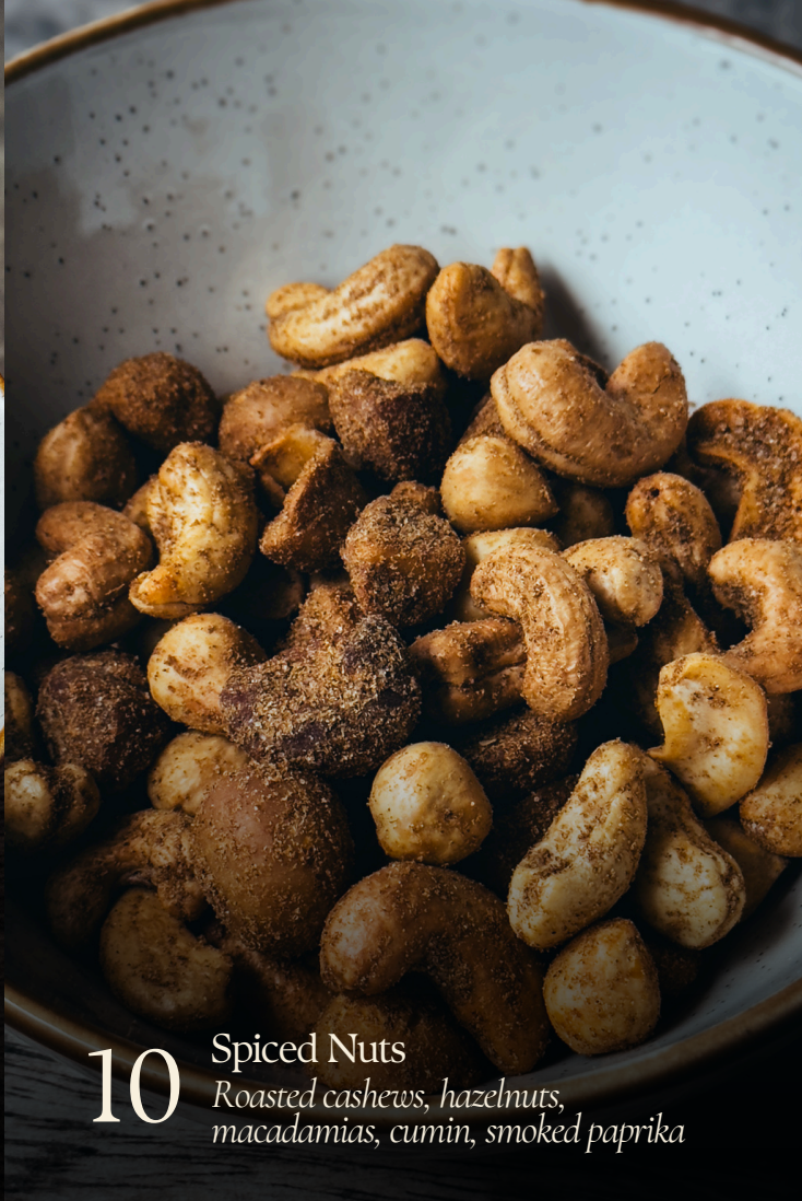
10 Spiced Nuts Roasted cashews, hazelnuts, macadamias, cumin, smoked paprika