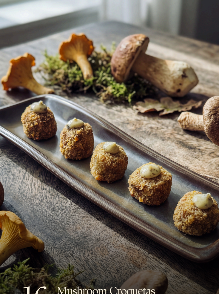
16 Mushroom Croquetas Truffle mayo