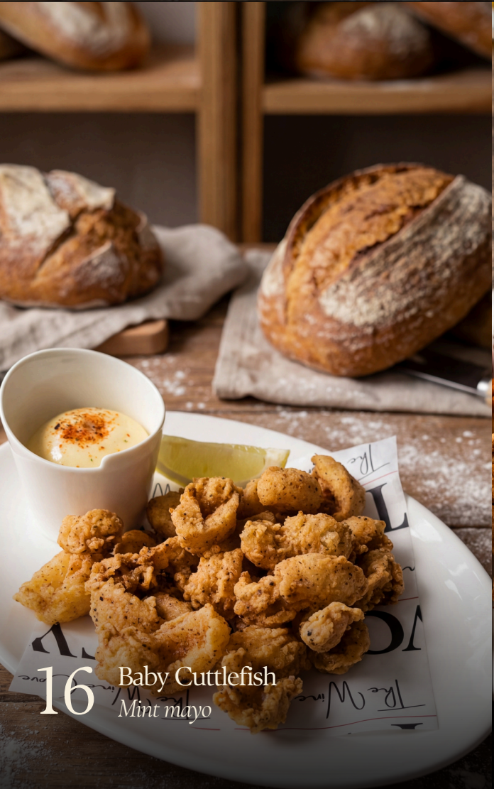
16 Baby Cuttlefish Mint mayo